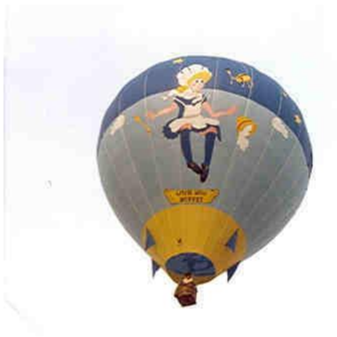
"Little Miss Muffett" was Fred's signature balloon.