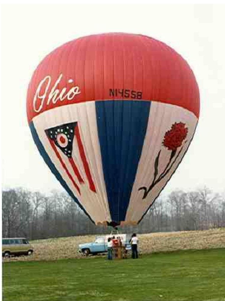
The "Ohio" Balloon with state symbols.